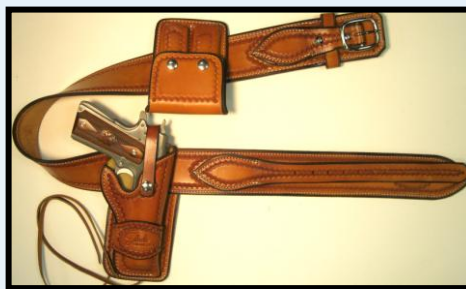
Belt for Gun Holster Border Stamp SL-03BGHBS