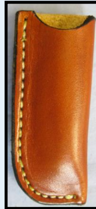
Belt Loop Knife Case With Quick Grab Access SL-17130Q SL-27130Q