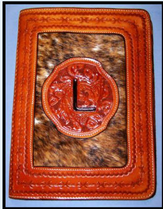
Notebook for Legal Paper w/Floral Tooled Logo Cowhide Insert Barbwire Border SL-04NBT