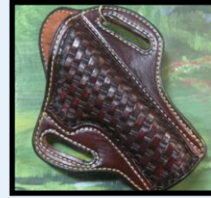
Pancake Gun Holster SL-01PSB SL-01PSBdk (dark)