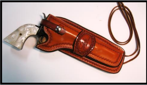
Old Style Belt Loop Gun Holster for Straight or Dropped Belt Border Stamp SL-030SBS