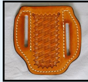
Slant Pancake Knife Case Basket Stamp, Both Sides SL-17124s (Small) SL-27124s (Large)