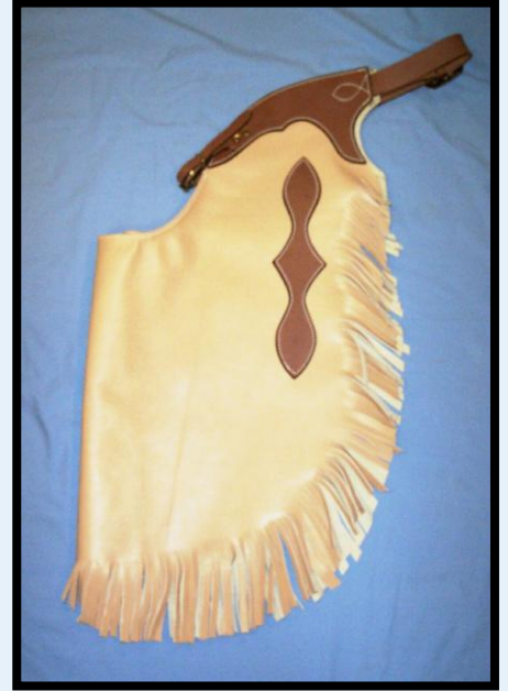
Standard Work Chinks SL-04SWC