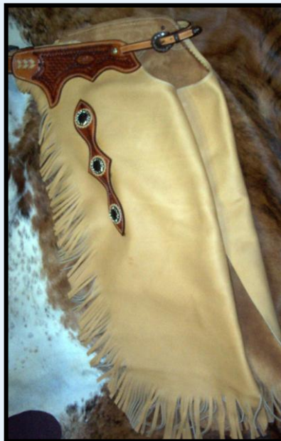
Show Chinks Basket Stamp Yoke SL-04SCBSY