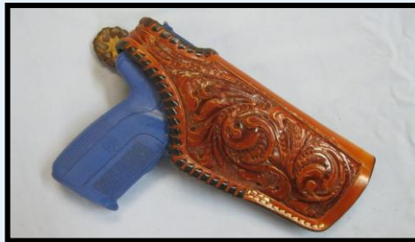
Thumb Break w/Whipped Edge Floral Tooled SL-03TFW