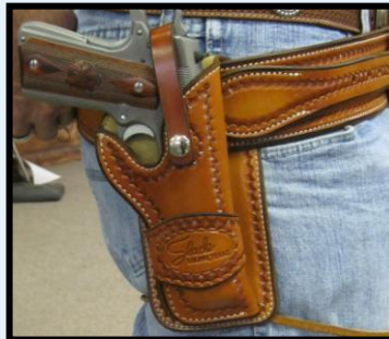
Belt Loop Gun Holster SL-030SBS