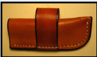
Side Mount Knife Case Smooth SL-17127 (Small) SL-27127 (Large)