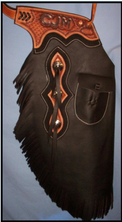
Show Chinks w/Pocket Custom Yoke SL-04SCCYP