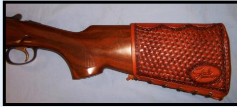
Rifle Stock End Cover Basket Stamp SL-04RSB