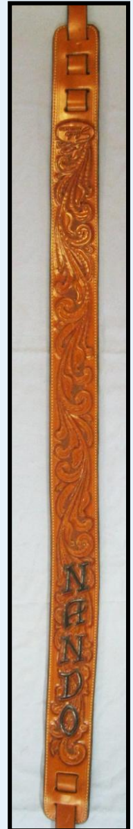
Guitar Strap Floral Tooled Padded SL-04GSFTP

Custom Items Custom Pricing Call for Details!