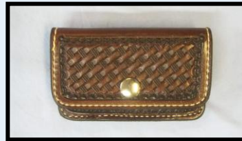
Business Card Holder w/Belt Loop Basket Stamp SL-03BCBS