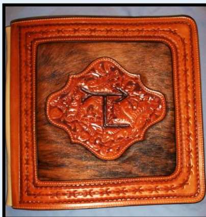
Photo Album w/Floral Tooled Logo Cowhide Insert Barbwire Border SL-04PAFT

These custom items are handcrafted and make the perfect gift. Interested? Call for pricing!