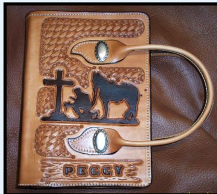
Bible Cover Cowboy Church Logo No Zipper w/Handles SL-03BCCC

These custom items are handcrafted and make the perfect gift. Interested? Call for pricing!