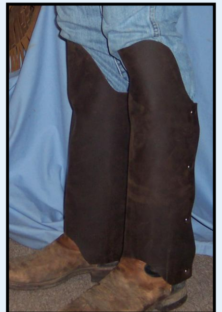
Rattle Snake Leggings SL-04RSL