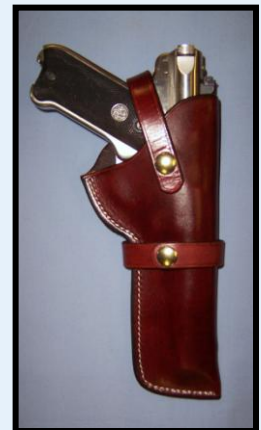
Hunter Special Belt Loop Gun Holster Plain SL-02HS