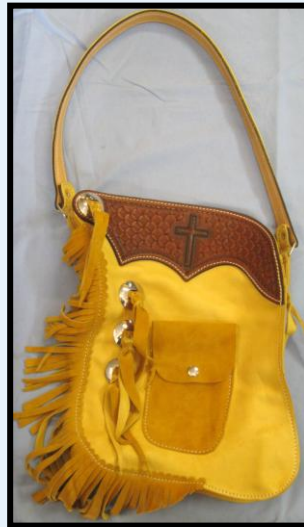
Soft Leather "Chaps" Purse Light or Dark SL-CHP