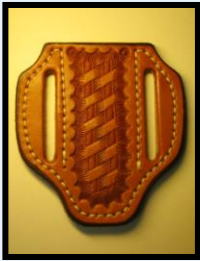
Pancake Knife Case Basket Stamp SL-17124 (Small) SL-27124 (Large)