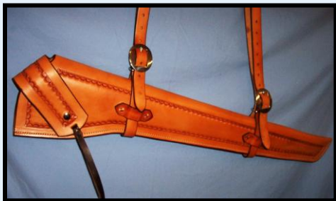
Saddle Scabbard Border Tool SL-300SSBT