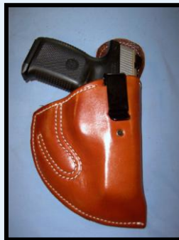
Concealed Hand Gun Case w/ Clip Plain SL-03CHGMC

* When ordering gun accessories, please refer to our order form for a directory of the guns and their abbreviations. If a gun is not listed, please call for assistance.