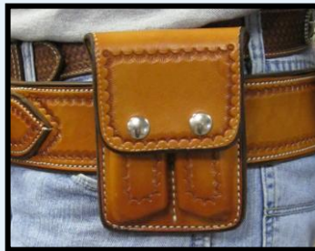
Dual Clip Bullet Holder SL-040BCBS