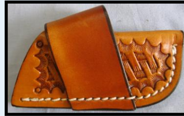
Slant Side Mount Knife Case Basket Stamp, Both Sides SL-17126s (Small) SL-27126s (Large)