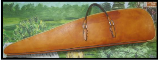
Rifle Case All leather, lined, padded, with zipper. SL-300rs