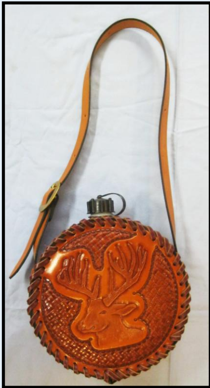
Canteen Cover w/Deer Head Basket Stamp SL-06CCDH