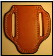
Pancake Knife Case Smooth SL-17125 (Small) SL-27125 (Large)