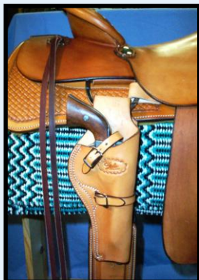
Flank Billet Holster SL-303b