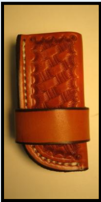
Belt Loop Knife Case Basket Stamp SL-17129 (Small) SL-27129 (Large)