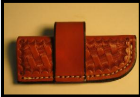
Side Mount Knife Case Basket Stamp SL-17126 (Small) SL-27126 (Large)