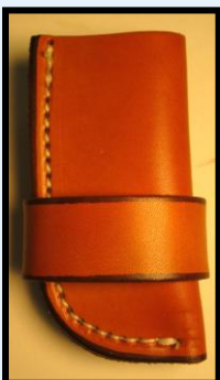
Belt Loop Knife Case Smooth SL-17130 (Small) SL-27130 (Large)