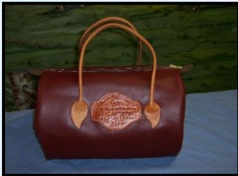
All Around Duffle Bag Good for Hunters! 17"long 11"high 10"deep SL-05AADB