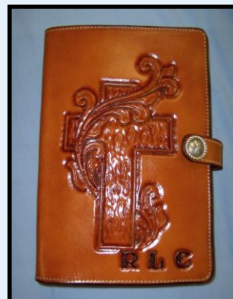
Bible Cover w/Cross SL-03BCC