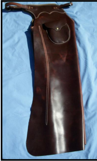
Work Shotgun Chaps Oil Tan Leather SL-04SWOT