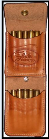
Rifle Shell Holder w/ Belt Loop Basket Stamp SL-05RSHB