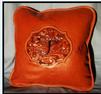
Leather Pillow w/Tooled Logo SL-04LPT