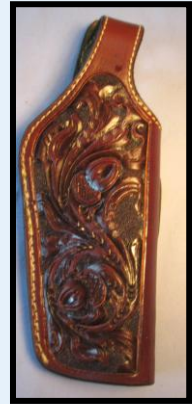
Thumb Break Floral Tooled SL-03TBF