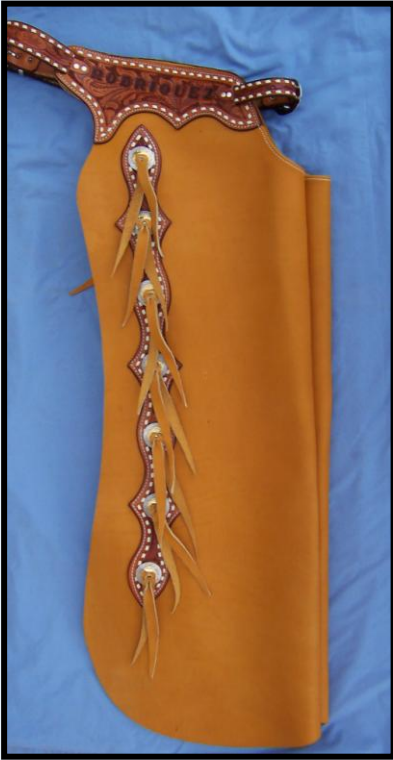
Batwing Chaps Floral Yoke Buck Stitch SL-04BCTYB